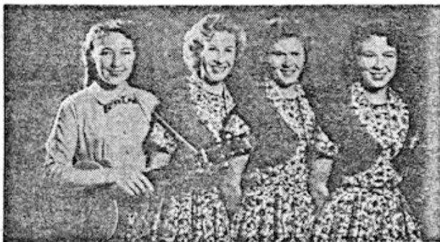
THE MELODY FOUR