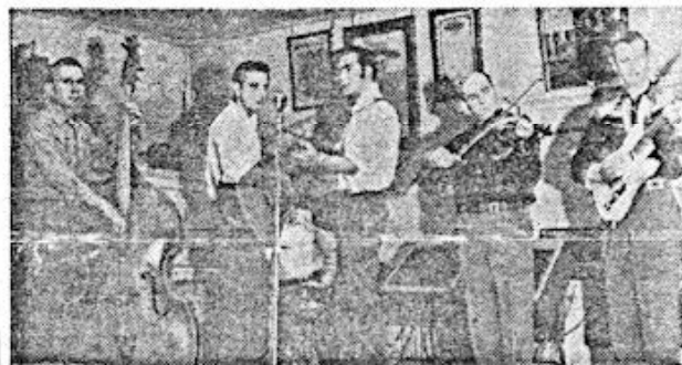
THE RHYTHM RANCH BOYS